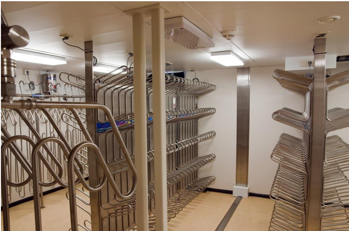
Clothes and boot dryers