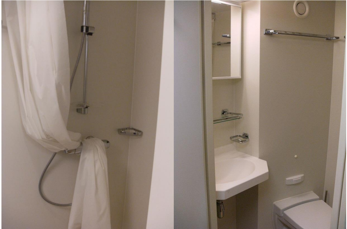
Private wet room for each cabin