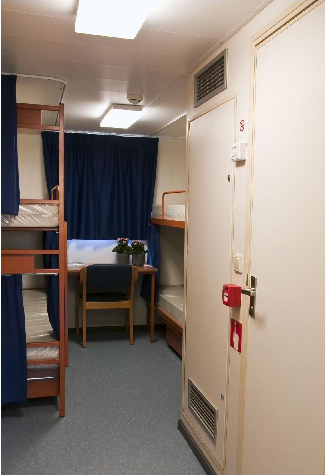
4 man cabin to be converted into single cabin