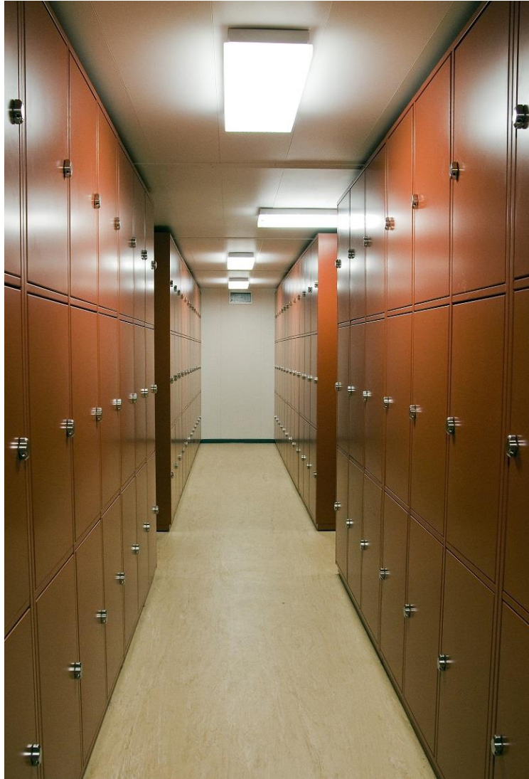
Change room/Luggage store