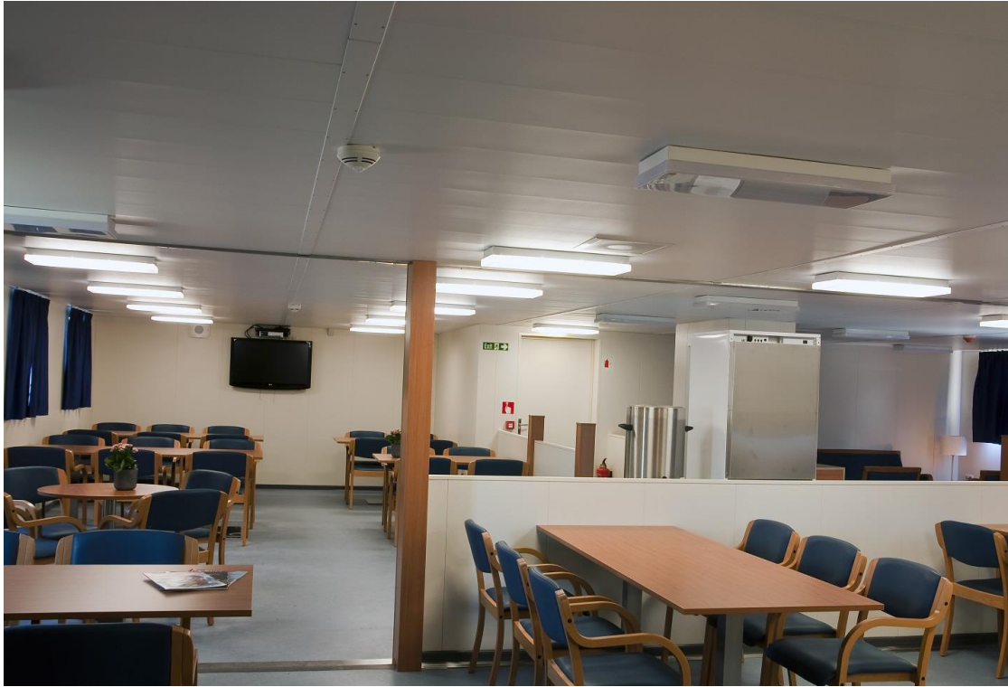
Recreation room 1